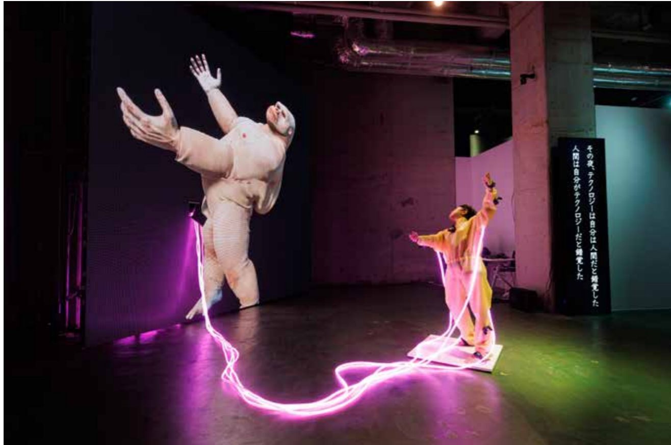
Fig. 3: Yamauchi Shota, Maihime , 2021.

ber skins and a silicon tube which mediate human and nonhuman. On the screen, a gorilla-like 3DCG creature with double skin, which looks like either an organic membrane or an industrial rubber suit, presents mechanical gestures. The contact of the two layers seems to make the creature vigorous, for when it strips itself of the outer layer, it rapidly becomes aged and weakened. This contrast of vitality is also seen in the performance accompanied by the work. A performer in a rubber suit is connected to the creature on the screen through a silicon tube implying an umbilical cord and they dance in sync. This connection presents the sensual relationship between humans and nonhuman actors such as animals, technological apparatus or digitally processed imagery. In addition, the creature and the performer with rubber skin have no distinct external genitalia, so this interspecific relationship does not seem to be based on the binary gender assignment.