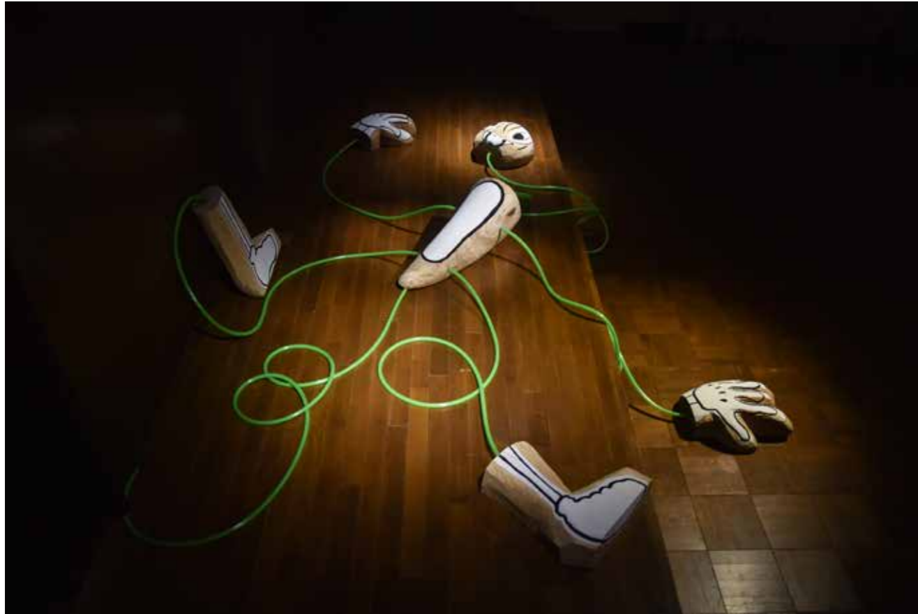
Fig.6: Takahashi Naohiro, Pretend to Be a Pretender , 2021-22. Painted on wood, hose, dimensions variable.

suggests that a figure of a two-dimensional character and a three-dimensional human body imitate each other in the dismembered but loosely connected condition.