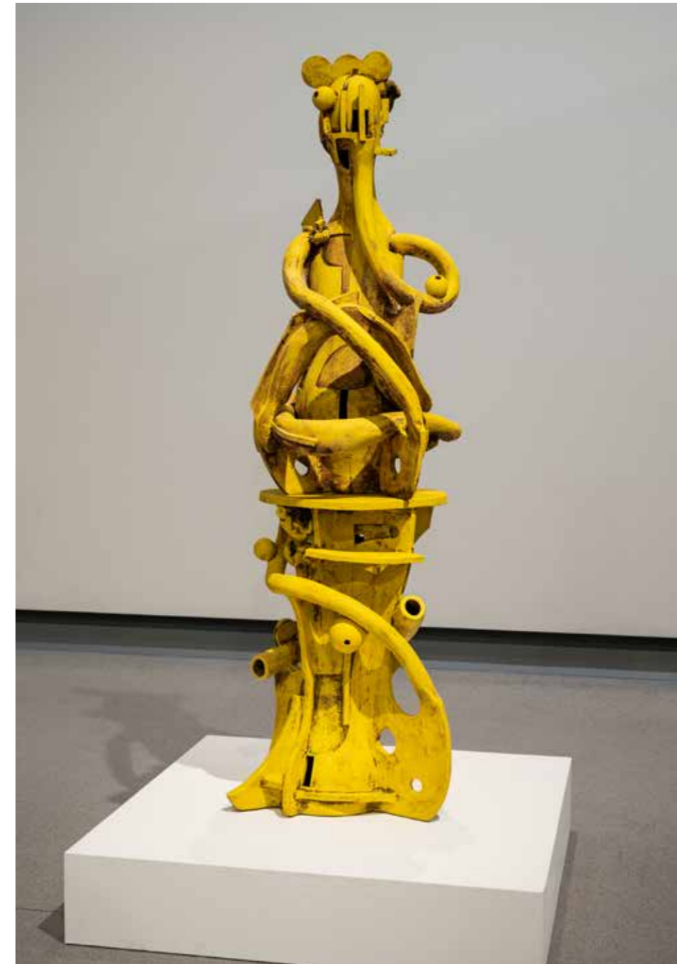
Fig. 1: Fujiwara Ayato, Images (Statue) / Images (Pedestal) -Axis and Surroundings-06, 2022-23 . Glazed ceramic, 190 × 55 × 57 cm.

The bionic rearrangement of bodies is introduced in the practices of Saeborg (born 1981), whose name clearly suggests cyborg. The artist's occasionally wearable rubber figures exaggerate their sensuous bulge of balloons. The tension on the skin as the sign of lively fullness produced by internal air pressure goes critical and paradoxically warns the end of its life, that is, the explosion of organs. Regarding his sculptural works covered with leather, Ishihara Tomoaki (born 1959) also mentioned this surface tension as a factor which defines the shape of a human body, referring to the image of explosive bodies depicted in Otomo Katsuhiro's manga AKIRA (1982-1990) (Ishihara, 2012). As for Saeborg, this externalization is realized in the works where female pigs are slaughtered and hung, or a part of their bodies is sliced and removed then their ribs are made to expose. Obviously, these depictions are related to the issues of feminism or animal welfare. And such features as the "exaggerated" quality of sensuousness, prosthetic structures, and radical hybridization transcend the nor-