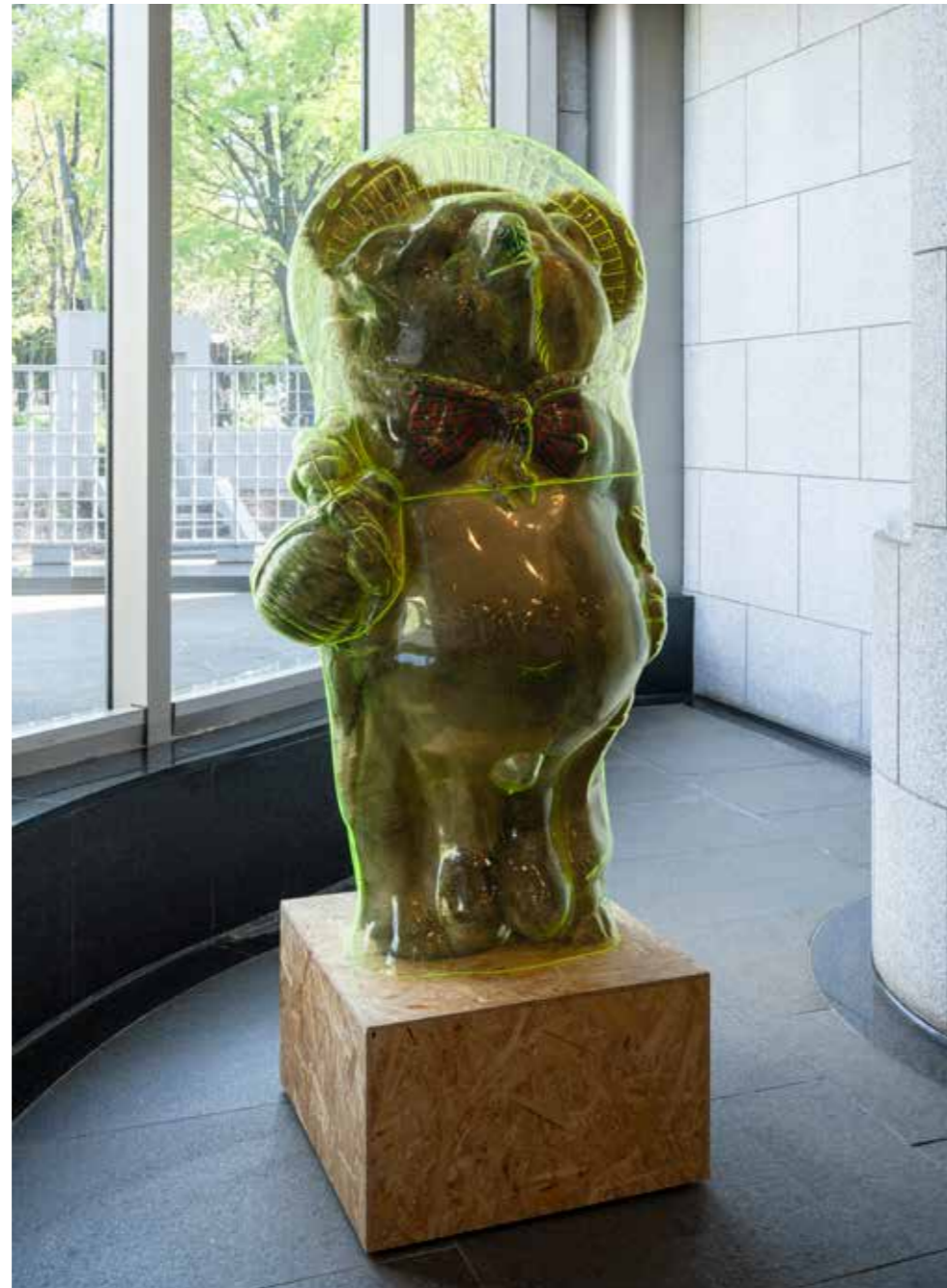
Fig. 2: Nagai Solaya, metaraction #10 , 2014. Teddy bear, acrylic, 148 × 80 × 70 cm.

to identify any “origin” of the definitive surface as idealized in Herder’s discussion on statues. Rather, the hybrid creature, the internal space of which is partially filled, but partially vacant, appears to be oscillating between life and death. The half-corrupted bear suggests it is dying, and the half-filled raccoon dog suggests it is in the embryonic phase toward birth or, in the parasitic relationship. It seems this in-between status that makes the sculptural figure fresh. The entanglement of life and death would have some relation to the charm of the stuffed duck Nagai purchased in the university days, which the artist describes as the dead creature standing as if it is living (Nagai, 2023).