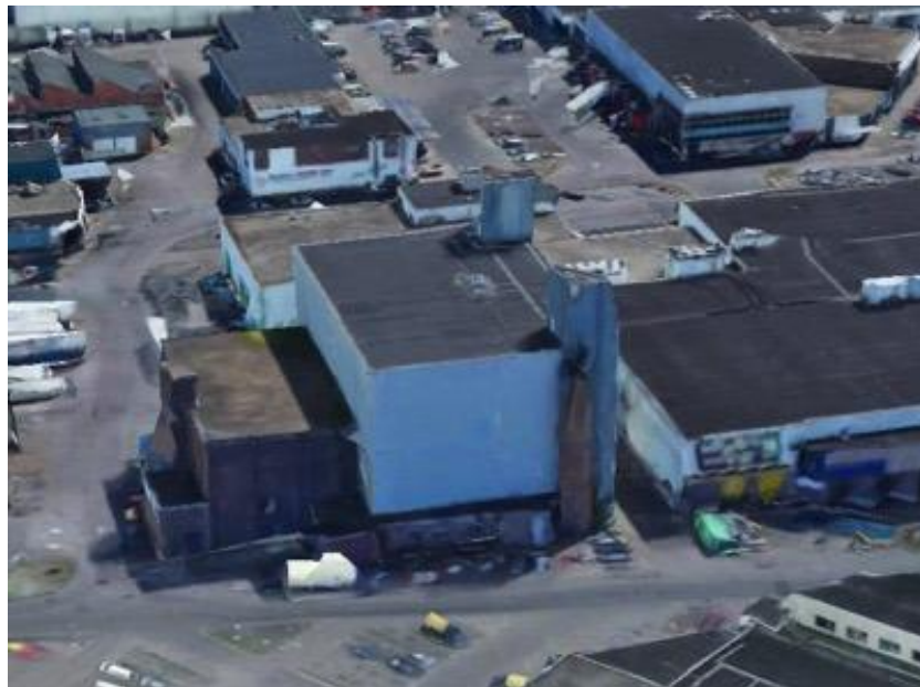
2. Building covered with sheet metal panels before their removal. Google Earth View

As previously mentioned, the entire building has completely covered with insulating panels [Fig. 2] in 1988 to address the issue of improper insulation that was causing serious damages to the artworks kept inside (is worth noting that the facility was used to store the artworks of the Stedelijk and History Museum).