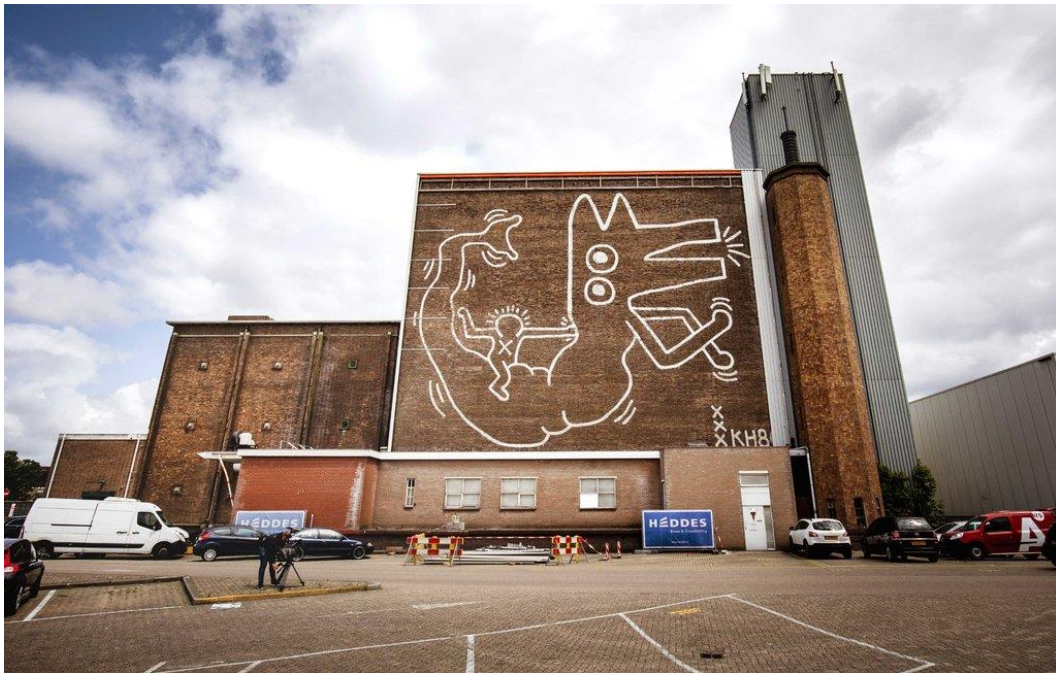
3. Mural by Keith Haring after the removal of the metal panels | ©REMKOO DE WAAL / EPA-EFE / REX / Shutterstock

A company equipped with a mobile boom blasted the panels from their supports, for a total of about 70 panels. In this manner, it was obvious that the panels were anchored to nine cross bars fixed to the wall with metal joints. The metal joints where the bars where positioned above were applied even above the paint film. The removal operation lasted 4 days and at the end the metal bars along with the joints were removed and once again the artwork can be admired in its full splendour [Fig. 3].