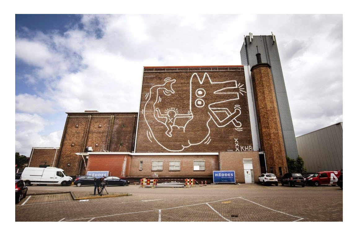
3. Mural by Keith Haring after the removal of the metal panels \mid ©REMKOO DE WAAL \mid EPA-EFE \mid REX \mid Shutterstock

A company equipped with a mobile boom blasted the panels from their supports, for a total of about 70 panels. In this manner, it was obvious that the panels were anchored to nine cross bars fixed to the wall with metal joints. The metal joints where the bars where positioned above were applied even above the paint film. The removal operation lasted 4 days and at the end the metal bars along with the joints were removed and once again the artwork can be admired in its full splendour [Fig. 3].