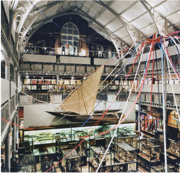
4. Candida Höfer, Pitt Rivers Museum Oxford , 2004

into subsequent circles until arriving at the present (Pitt Rivers, 1891: 117).