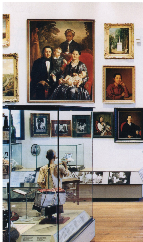
5. Candida Höfer, KIT Tropenmuseum Amsterdam VII , 2003

The fact that the history of colonialism and of prejudices towards non-European cultures are implicit in ethnological museum's nature and their display-related principles has led them to undertake an internal process of total reform, one of the most recent examples of which is the Quai Branly Museum, which was set up from scratch on the basis of exhibits from the old Musée de l'Homme and the Musée national des Arts d'Afrique et d'Océanie. Candida Höfer (2004: 37) photographed the original layout of the Trocadero Ethnographic Museum, conceived by Paul Rivet