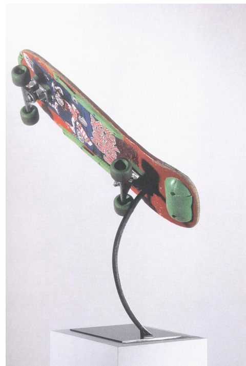
9. Bertrand Lavier, Chuck McTruck , 1995