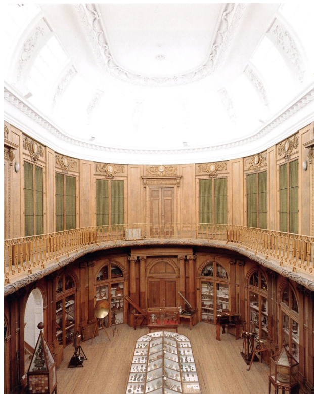
3. Candida Höfer, Teylers Museum Haarlem II , 2003

Scientific, military and trade expeditions brought large quantities of objects back to their respective metropolises, moulding the collections of the ethnological museums founded in Europe's principal cities as of the middle of the century. Those museum's dependency on colonial activity is entirely evident, due not only to the composition of their main collections but also to the ideology behind them and the goals pursued thereby, chiefly involving disseminating pro-colonialism propaganda. All the faces of a prismatic reality converged in the establishment of ethnological museums in Europe's main cities between the 1870s and 1900. They had a common governing ideology, under which non-European cultures, regarded as primitive or savage, were assigned to the realm of natural science and prehistory.