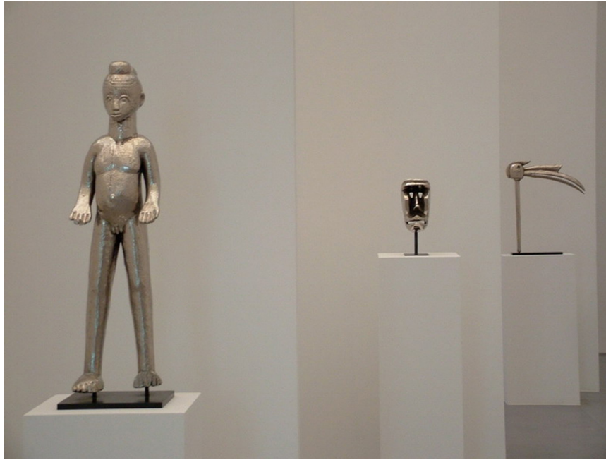
7. Bertrand Lavier, Iba , 2008

symbolic and technical process. However, Lavier reveals further meaning, namely that all religions are based on the relationship between humans and the transcendental, and all their objects of ritual have been aestheticized, deconsecrated and decontextualized upon entering museums. The artist has carried out the same deconsecration procedure that ethnological museums have performed on non-western objects of ritual. His nickel-plated bronze copy of Christ is no longer the cult image, although it still hints at its original function, just as the African sculptures do. The western and African cult objects belong to religious spheres that the west always thought incompatible. Primitive religion, regarded as barbaric, confronts Christianity, which Europe considered to be the only true religion throughout the colonial process. The Surrealists had already included African objects and Christian figures in The Truth about the Colonies , an alternative exhibition they staged in Paris in 1931 (Blake, 2002:51), where an image of the Virgin with Child was displayed as a «European fetish» alongside African sculptures of ancestral figures.