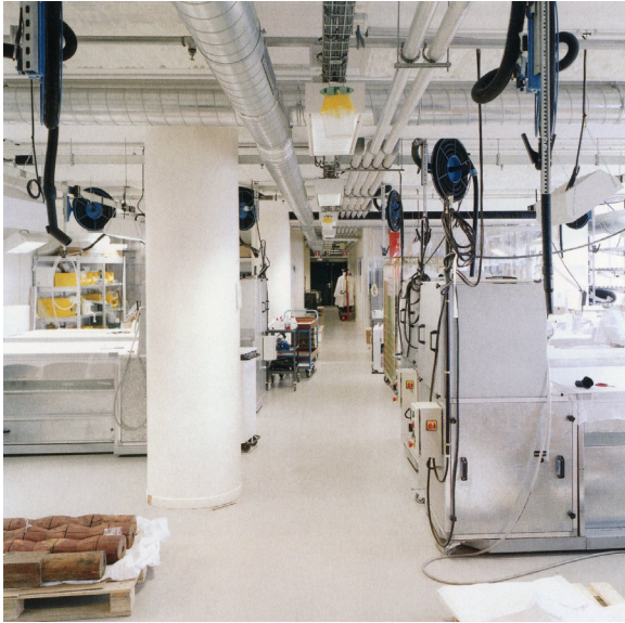
6. Candida Höfer, Musée du Quai Branly Paris I , 2003