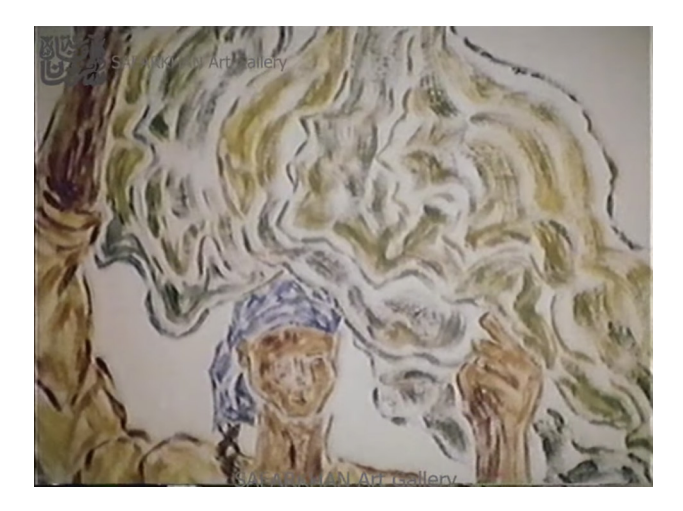
8. Film still, Inji (1988), dir. Mohamed Sha'aban