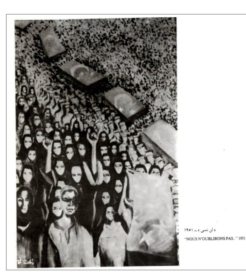
3. Inji Efflatoun, We Cannot Forget , 1951. Image now lost, reproduction in Bibliotheca Alexandrina 'Memory of Modern Egypt' repository

the nexus of the earth and laboring people. She also sought to achieve political activation in the work. At her first solo exhibition, which was held in Cairo only four months before the 23 July 1952 Free Officers' coup d'état, she captured the angry anxiety of the times in paintings of martyred sons and clashes with British occupying troops [3] .