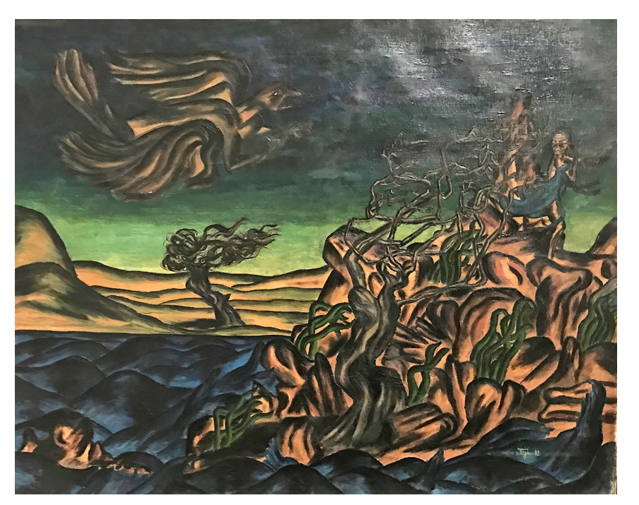
1. Inji Efflatoun, The Girl and the Beast , 1941, oil on canvas.

these exchanges in her painting. We see depictions of the interior subjects of gendered, classed anxieties: dream imagery of vengeful trees, creeping vegetation, and serpents that grasp at other beings – including frightened young women – as day turns to night.