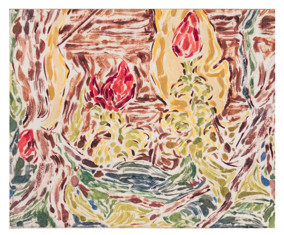
6. Inji Efflatoun, Banana , c. 1960s, oil on carton, 30 x 25 cm.

and capitalism. Having supposed that Efflatoun might refute such fetishized tropes, Henein interprets her pictures of hyper-floriated lands of plenty as elaborate evasions of the mastering gaze. Imagining that such landscapes might possess the power to impose themselves on the artist, Henein diagnoses the inverted agency of the artist who is disidentified from a masculine subject position. Might worldly light have flooded Efflatoun to the point of visual impairment? Does the world cast a spell on its female subjects?