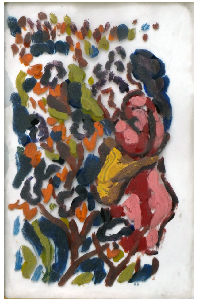
5. Inji Efflatoun, Collecting Eggplant , c.1960s, oil on glass, 16 x 9 cm.

Importantly for tracking the intersection of theories of gendered vision in Efflatoun's, we must note that Henein also makes reference to the question of subject positions in his review. Specifically, Henein writes that the landscapes show nature as it manifests «to a woman», which is to say that they