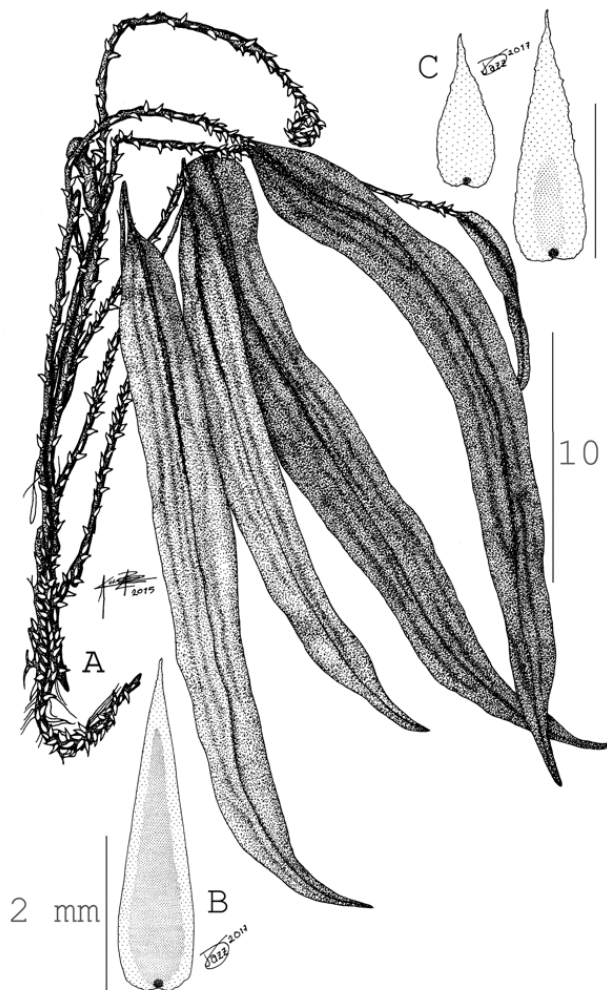
Figure 1. Elaphoglossum pallidosquamum (A. Rojas & P. Muñoz 11254, CR): A. Habit. B. Rhizome scale. C. Stipe scales. Figura 1. Elaphoglossum pallidosquamum (A. Rojas & P. Muñoz 11254, CR): A. Hábito. B. Escama del rizoma. C. Escama del estípote.

Elaphoglossum pallidosquamum A. Rojas & P. Muñoz, sp. nov. (fig. 1, 2).