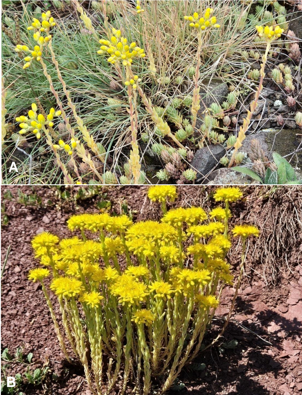
Figure 2. Petrosedum thartii . (A) inflorescences before anthesis (above Coll de Vanses in Alàs i Cerc); (B) inflorescences during anthesis (to the east of Port del Cantó in Montferrer i Castellbò).

Plants assigned to P. thartii thrive at altitudes between 1000 and 2300 m a.s.l. (submontane to subalpine vegetation belts) but are commonest at 1300-1600 m a.s.l. in the montane belt. All localities are on siliceous rocks, in some places slightly carbonated, and to date this species is not known from limestone in the Pyrenees. The most common habitats are rocky slopes with very thin soils and roadsides, always in the open where there is little or no woody cover, and generally on south-facing slopes.