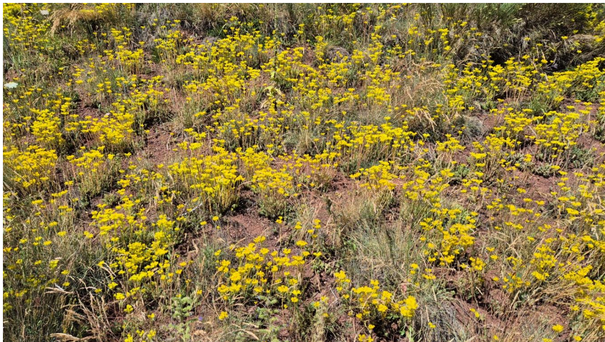
Figure 4. Population of Petrosedum thartii on a roadside, to the east of Port del Cantó in Montferrer i Castellbò. Figura 4. Población de P. thartii junto a una carretera, al este de Port del Cantó en Montferrer i Castellbò.

in light of the revision of herbarium sheets attributed to P. rupestre , which turned out to be P. thartii , thus, the presence of P. rupestre in this country could not be confirmed (Gallo, 2014). We found P. rupestre mainly at low altitudes in areas of subhumid Mediterranean climate, which coincides with observations by Italian authors who consider that this species is found chiefly in relatively low and warm areas (Gallo, 2017).