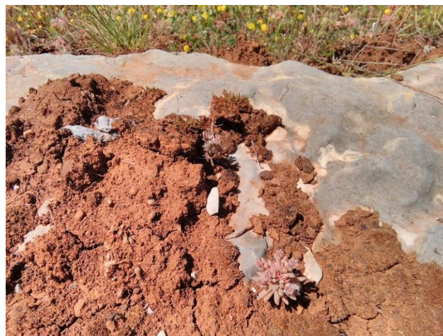
Figure 2. Sedum rubens growing near Valverde (Ribatejo) in central Portugal.

class Tuberarietea guttatae Rivas Goday & Rivas-Martínez 1963 nom. mut. (Costa et al. , 2010).