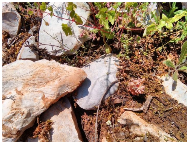
Figure 3. Sedum rubens growing near Casais Monizes (Ribatejo) in central Portugal.

The distribution of S. rubens is now clarified, extending to all Portuguese provinces, with the exception of Minho and Beira Alta, following the delimitation of Flora iberica .