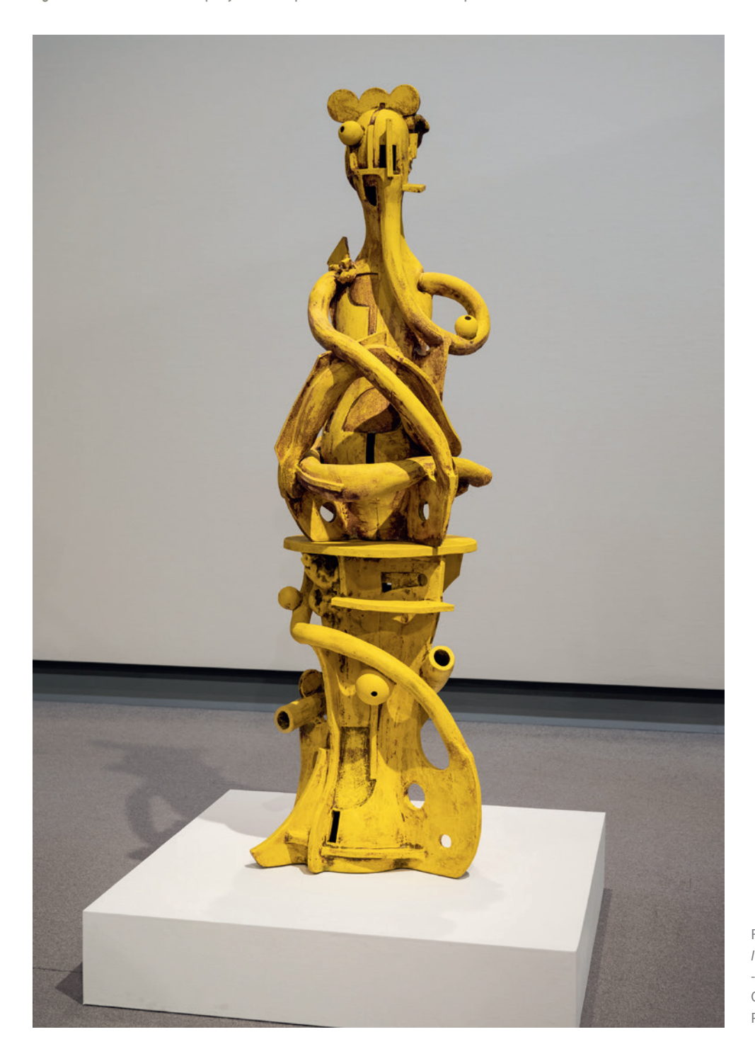
Fig. 1: Fujiwara Ayato, Images(Statue) / Images(Pedestal) -Axis and Surroundings-06, 2022-23. Glazed ceramic, 190 × 55 × 57 cm. Photo by Yanagiba Masaru.

mative representations of stereotypically gendered or classified bodies. Saegorg describes the body in a latex suit as comparable with toy dolls or drag queens (Saeborg, 2017).