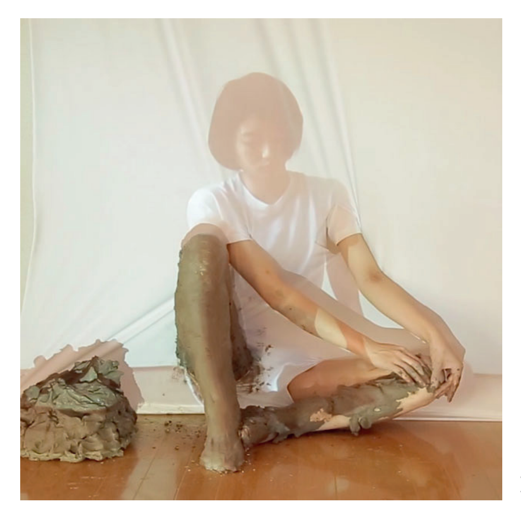
Fig. 4: Maeda Kasumi, The Distant Body, 2019. Video, 9 min 13 sec. Video shooting by comuramai.

jected. On the other, a fabric screen within the former image, Maeda's figure is projected. In the video, the body image caught up in the optical gap between the two screens conveys, as the title suggests, the farness of the body which evades from grasp.