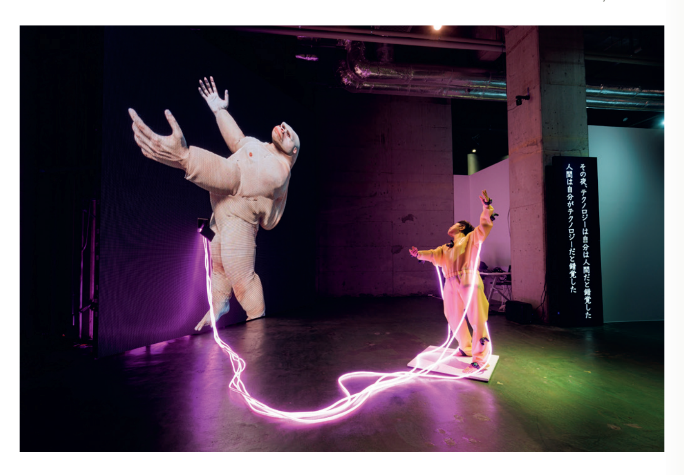
Fig. 3: Yamauchi Shota, Maihime, 2021.

ber skins and a silicon tube which mediate human and nonhuman. On the screen, a gorilla-like 3DCG creature with double skin, which looks like either an organic membrane or an industrial rubber suit, presents mechanical gestures. The contact of the two layers seems to make the creature vigorous, for when it strips itself of the outer layer, it rapidly becomes aged and weakened. This contrast of vitality is also seen in the performance accompanied by the work. A performer in a rubber suit is connected to the creature on the screen through a silicon tube implying an umbilical cord and they dance in sync. This connection presents the sensual relationship between humans and nonhuman actors such as animals, technological apparatus or digitally processed imagery. In addition, the creature and the performer with rubber skin have no distinct external genitalia, so this interspecific relationship does not seem to be based on the binary gender assignment.