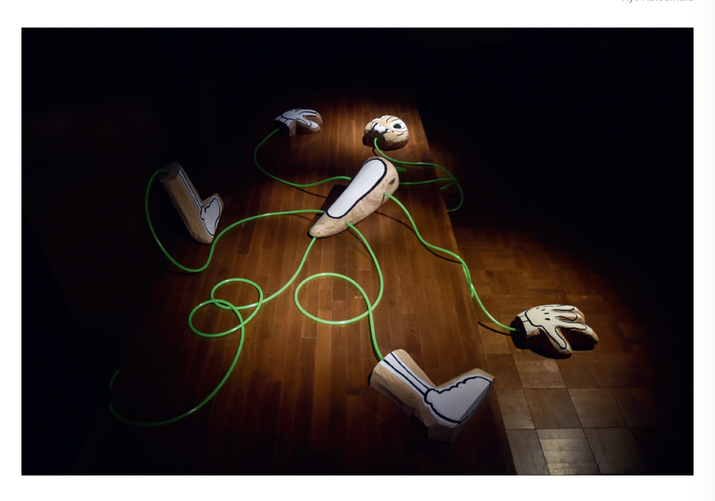
Fig.6: Takahashi Naohiro, Pretend to Be a Pretender, 2021-22. Painted on wood, hose, dimensions variable.

suggests that a figure of a two-dimensional character and a three-dimensional human body imitate each other in the dismembered but loosely connected condition.